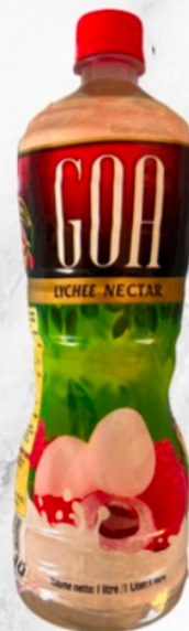
LYCHEE NECTAR 1L