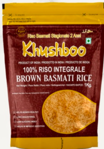
BROWN BASMATI RICE PACKING AVAILABLE 1KG, 5KG