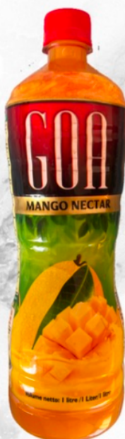
MANGO NECTAR 1L