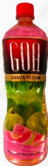
GUAVA NECTAR 1L

Made with real fruit pulp, each sip delivers a deliciously thick and rich texture, bursting with the authentic essence of fruit.