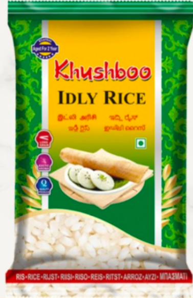
IDLY RICE PACKING AVAILABLE 5KG, 10KG, 20KG