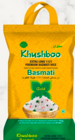
GOLD BASMATI RICE PACKING AVAILABLE 1KG, 10KG, 5KG, 20KG