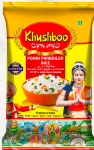
PONNI PARBOILED RICE PACKING AVAILABLE 5KG, 10KG, 20KG