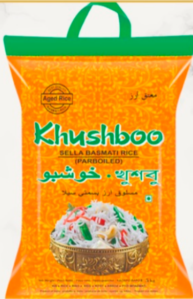
SELLA BASMATI RICE PACKING AVAILABLE 5KG, 10KG, 20KG