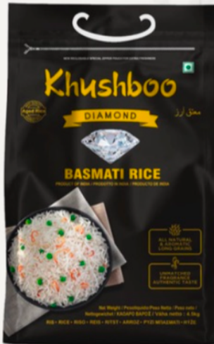
DIAMOND BASMATI RICE PACKING AVAILABLE 900G, 4.5KG, 18KG