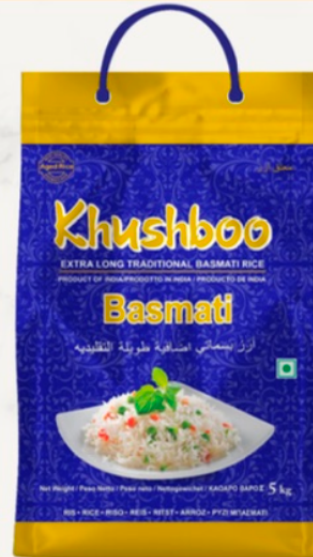
EXTRA LONG BASMATI RICE PACKING AVAILABLE 1KG, 5KG, 20KG