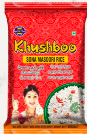
SONA MASOORI RICE PACKING AVAILABLE 5KG, 10KG, 20KG