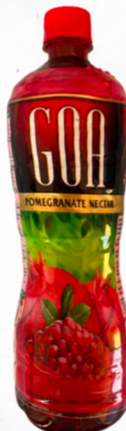
POMEGRANATE NECTAR 1L